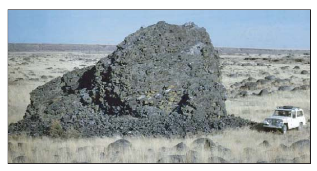
Deposits of the cataclysmic Missoula floods. The largest boulder has a long axis of 18 m. It was eroded from scabland basalt outcrops and was transported about 10 km to the proximal portion of the immense Ephrata Fan, which covers about 1000 km² of the Quincy Basin in east-central Washington state.

polymath William Whewell, who in 1832 named this principle "uniformitarianism." Epistemological uniformitarianism holds that scientifically reliable inferences about the past must be confined to invoking only the slow-acting, low-magnitude processes currently in evidence to human observers.